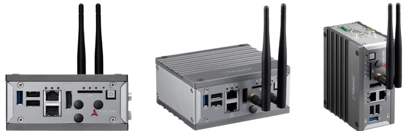
■ MXE-200/200i with Antenna