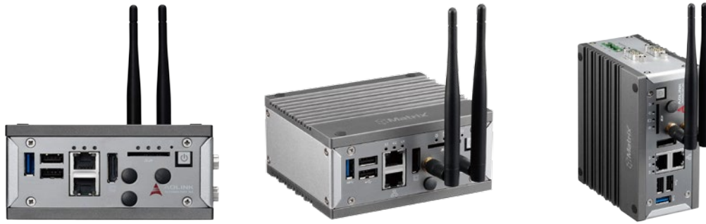
MXE-200/200i with Antenna