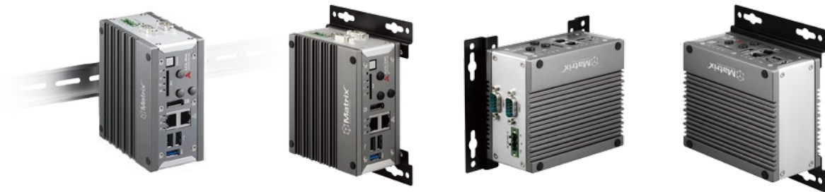
The MXE-200/200i is easily installed in popular mounting configurations, including DIN rail and wall mounting.